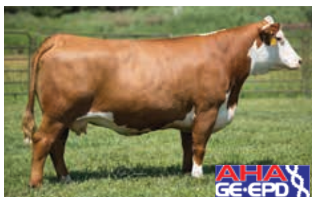
Dam of Lot #17