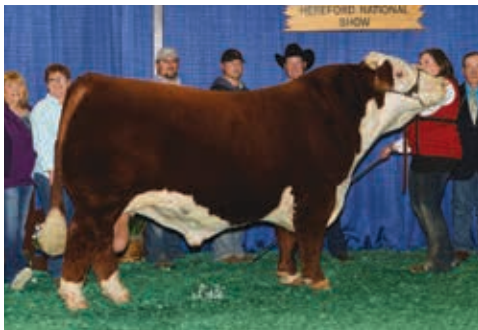
Sire of Lot #1 • KLD RW BOUNCER D41 ET