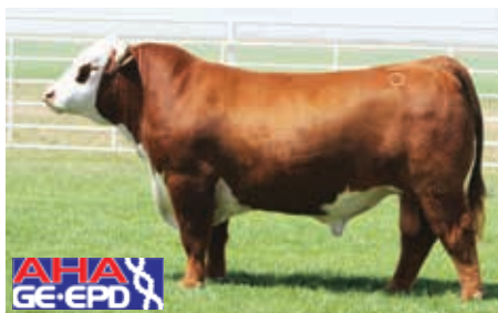
Sire of Lot #17