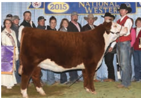
Dam of Lot #13 • JCSTATERTOT 3560

7545 is dark red, horned bull calf you won't want to miss. Being an own son of the famous 2015 National Champion Horned female "3560" donor, we are offering you the best! He's big footed, big hiped and big topped but still smooth in his shoulder and can't fault this red eyed bull on the move. On the profile, you have to love his depth of body, clean chest and the length and extension of his neck. This mating has been proven over and over again, claiming Grand Hereford heifer at the Tulsa State Fair, Oklahoma Youth Expo and the Western Nugget Junior Show. Don't miss out on this great herd sire!